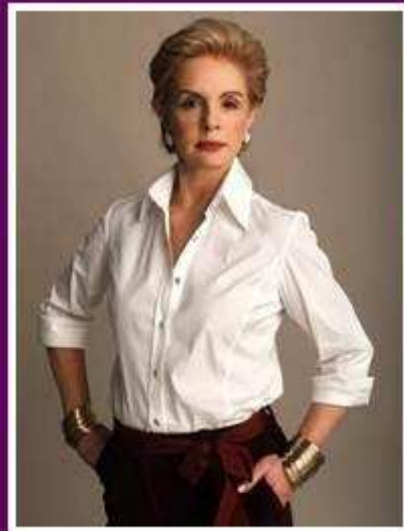
Carolina Herrera, Venezuela International fashion designer