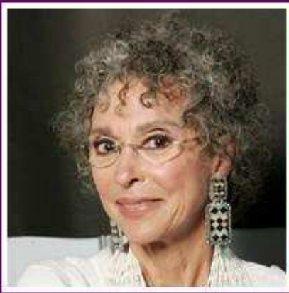
Rita Moreno, Puerto Rico Only Hispanic to have an Oscar, Grammy, Emmy, and Tony