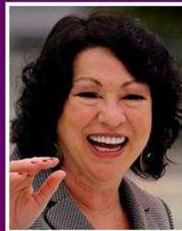
Sonia Sotomayor, Puerto Rico First Hispanic Supreme Court Justice