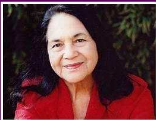
Dolores Huerta, Mexico Immigration & Civil Rights Leader