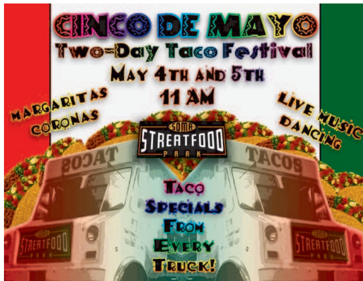
San Farancisco, California

On these two pages you will find how Cinco de Mayo has been commercialized across the United States by some. To your upper right, we find a contest in Minnesota where smashing piñatas is the sport of the day. Below you will even find an invitation to bring your own moustache in Florida .