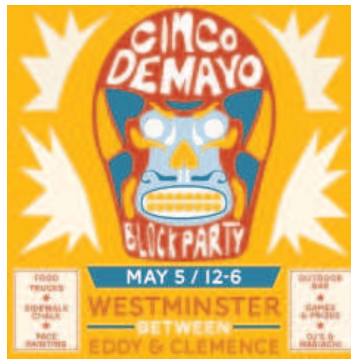
Providence, Rhode Island