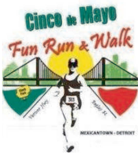
Cinco De Mayo 7th Annual Detroit Mexican Town Fun Run & Walk