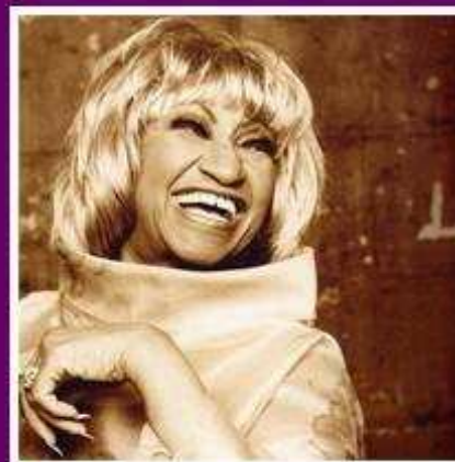
Celia Cruz, Cuba Queen of salsa, 23 gold albums