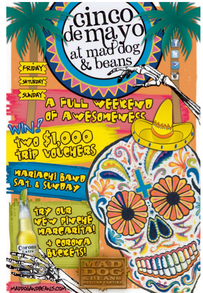
New York, New York