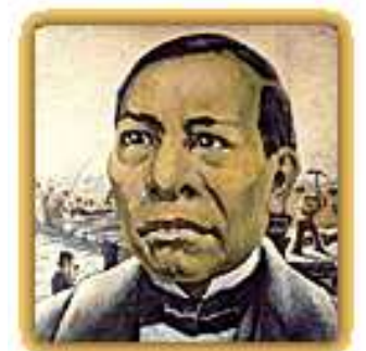
President Benito Juárez

imposition of a French prince. Napoleon's goals were further encouraged by Conservative exiles, who saw a monarchy as a means of preserving their privileges, and the support of the surviving Conservative opposition. When it became clear that the French had no intention of leaving Mexico after successful debt negotiations, the tripartite agreement was dissolved and the British and Spanish forces withdrew from Mexico .