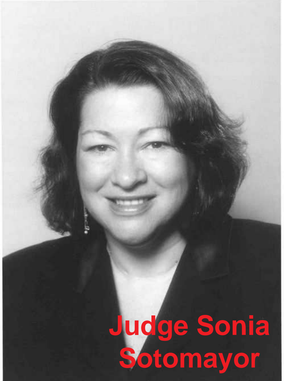
Judge Sonia Sotomayor

Los Texas Wranglers Celebrate 10th Year Anniversary